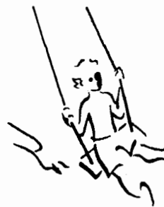
Swinging into a new Millennium

The Village Hall Committee view the playing field as a valuable resource and believe this can be best served by the financial running made from Wymondham Town Council. Originally the playing field was bought by Wymondham Town Council's predecessor in the 1930's for the recreational use of the Spooner Row residents. A new management committee will be formed and they will be electing two representatives from Spooner Row on 27th January at 7pm.